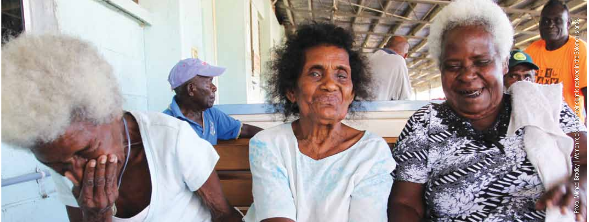
Women rejoice after their sight is restored in the Solomon Islands

“INVESTING IN EYE HEALTH PAYS A DISPROPORTIONATELY LARGE SOCIAL AND ECONOMIC DIVIDEND. WE JUST NEED THE RESOURCES TO MAKE IT HAPPEN.”